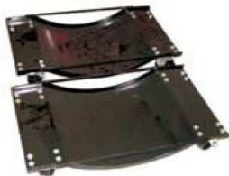
SP97067: CAR MOVING DOLLY Ideal for: Body shops, showrooms, mechanical shops