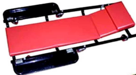
SP97029: 40" CREEPER W/ TOOL TRAY Package Size: 63x11x104cm Weight: 8.0kg