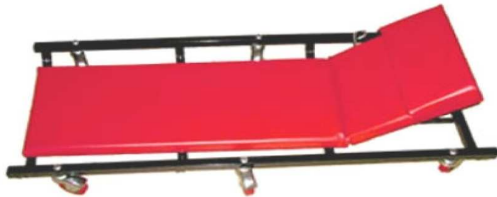
SP97030: 40" CREEPER Package size: 44x11x103cm Weight: 8.0kg