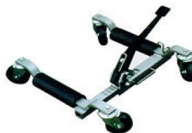
SP13101: VEHICLE POSITIONING DOLLY The quick action double pawl ratchet progressively "squeezes" the vehicle tire between two rollers until the tire is lifted off the ground. Once all four tires are off the ground, the vehicle can be positioned anywhere in the shop. Ideal For: Body Shops, Showrooms, Mechanical shops, Parking garages, Classic cars