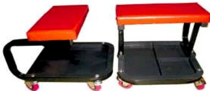
SP97025: ROLLER SEAT Package Size: 44x37x48 Weight: 8.5kg