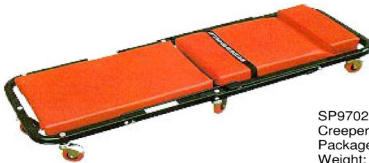
SP97026: 48" TWO-IN-ONE FOLDING CREEPER Creeper and Roller Seat with Adjustable Head Rest Package Size: 44x15x120 Weight: 14kgs