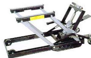
SP17101: MOTORCYCLE LIFT

1250lbs Capacity Min. Height: 120MM Max. Height: 510MM Weight: 35KGS