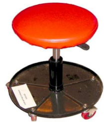
SP97062: HYDRAULIC ROLLER SEAT Min. Height: 15" Max. Height: 19-1/2" Adj. Height: 4-1/2"