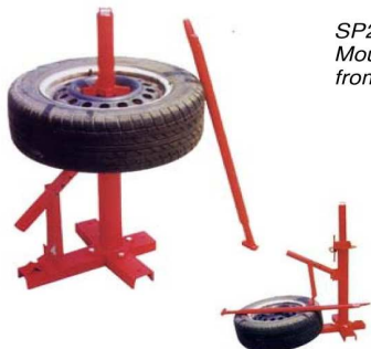
SP26101: PORTABLE TIRE CHANGER Mounts and demounts a full range of tires from 8" to light truck